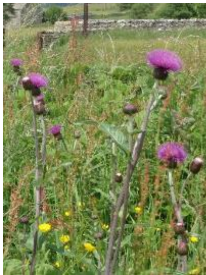
Melancholy thistle, Slaidburn AONB 2013,.