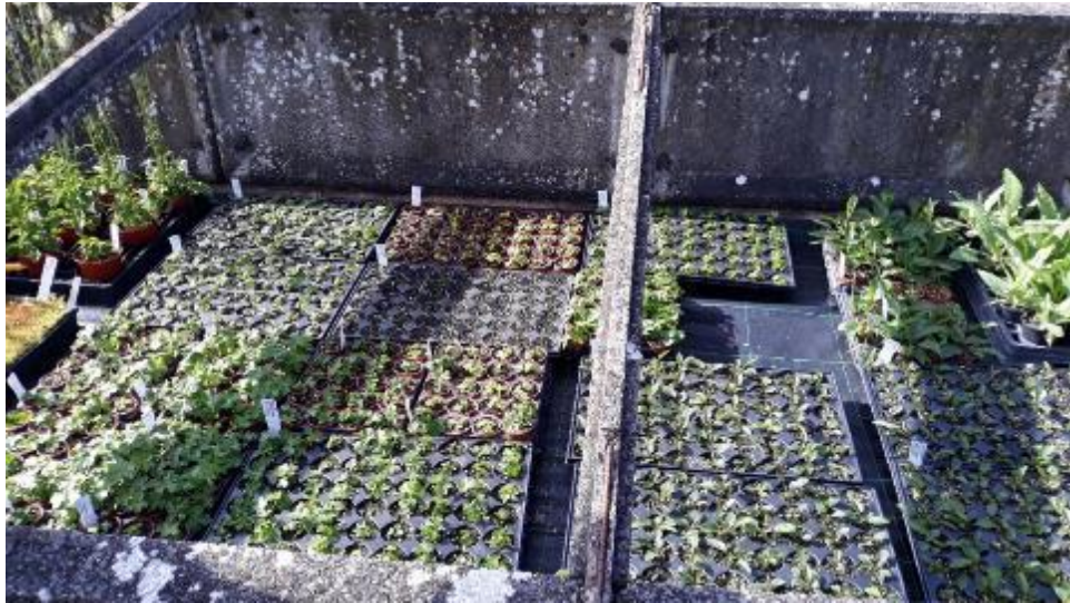
Hay Time Rescue plug plants out in cold frames at Kew Millennium Seed Bank June