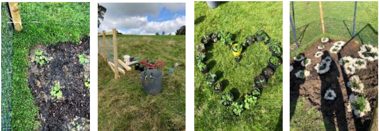
Plug plants going in at Swainshead Hall Farm, September 2019, C.E.

Swainshead Hall Farm near Scorton was another of the project sites. The landowner engaged volunteers from Lancaster University to help with seed propagation and plug plant "fostering", growing saw-wort and globe flower seeds. These were transplanted on "Landscapes for Life" day, 21st September 2019, with further melancholy thistle plugs from Kew being added in October.