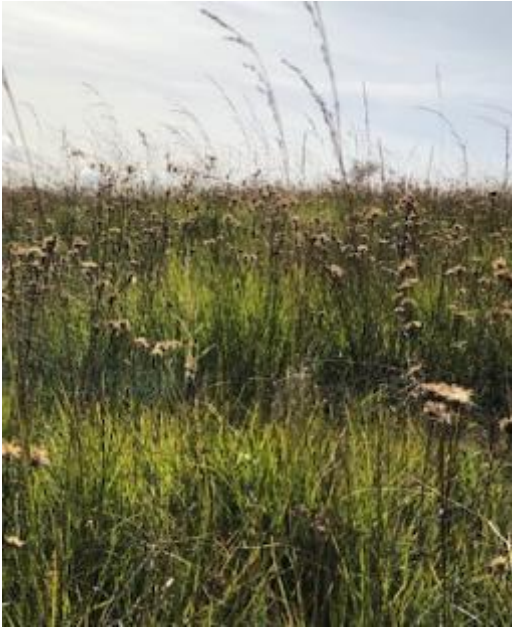
Saw-wort, seed heads ready for collection at Hole House Lane Meadow, Slaidburn. 2019, C.E.

The seed for the project was collected in late August and September 2018 from various sustainable and long standing populations in the area. No more than 25% of the available seed was collected at any site, to ensure that the population would not be affected. The grid reference for each site was collected by GPS to enable the creation of a GIS map layer at the end of the project showing all the donor sites and receptor sites, with positions accurate to <10m ( Appendix 1 ).