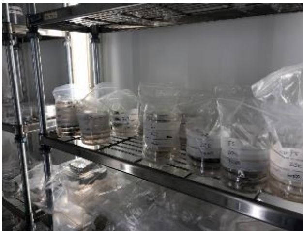
Inside one of the incubators and the sub-zero storage chambers at the Millennium Seed Bank 2019, C.E.