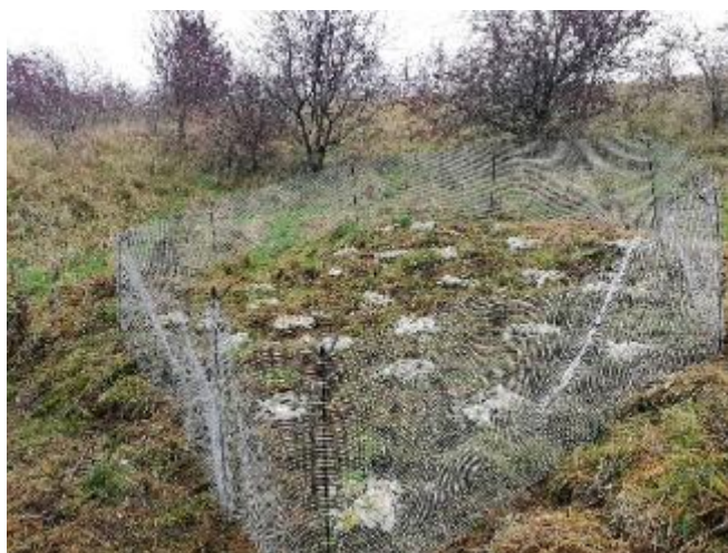
Plug plants in situ at Bell Sykes Farm, Slaidburn, October 2019, C.E.

The site for the globe flower is a north-west facing slope of rough pasture infrequently grazed by low numbers of sheep. With the help of two volunteers, a further 100 plugs were added in the same two areas in October 2019, with the additional protection of sheep fleece to guard against slugs.