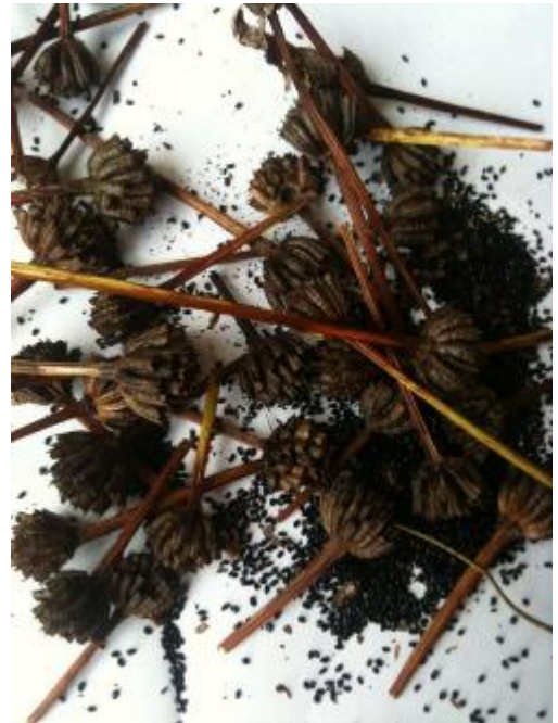
Globeflower heads and seed, AONB 2016