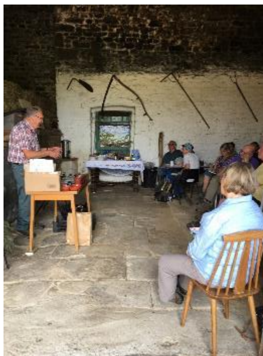
Participants in the "seed collection and propagation" event August 2019.

In July, an information stand at Forest of Bowland Meadow Open Day was used to promote the Hay Time projects, giving information on the work we have undertaken over the last few years and the current Hay Time Rescue project. There was a good number of attendees (approx. 200), and plenty of interest in this project and future restoration projects. This is a great opportunity to chat to a larger audience of interested participants and to pass on messages about the importance of wildflower habitats, and the work done through our projects to enhance and conserve them.