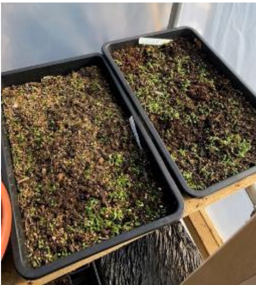
Globe flower seedlings germinated at New Laithe, Newton-in-Bowland. 2018, C.E.

The seed was collected on dry days, and put into paper bags, rather than plastic, to keep the moisture levels to a minimum. Each collection was split, with 50% going to Kew Millennium Seed Bank, and the remainder distributed among the five volunteer growers, and a small amount retained in the collection at the AONB. The seed was sown into trays by the volunteers as soon as possible following collection to maximise the viability, as they can start to deteriorate once picked if not in the right conditions ( Appendix 2: Kew MSB Seed Collection Notes ). Peat free compost was used as the medium, and most were left out to "stratify", that is to experience a frost to stimulate germination. Some were moved under cover in spring, and then potted on when large enough.