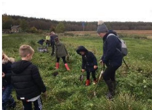
Pupils from St James' School enjoying their plug planting experience, Gisburn Forest 2019, C.E

Bell Sykes farm in Slaidburn, the site of the Coronation Meadows and donor for much of the green hay in our restoration work, was both a donor of the melancholy thistle seed, and a receptor for globe flower, saw-wort and melancholy thistle plug plants in separate areas of the farm. Six globe flower plugs from 2016 seed were planted in the spring of 2019, with mesh guards to protect from grazing animals. One group of three did really well, producing a flower head and seed, but the remaining three were devoured by slugs. They may, however come through again in 2020.