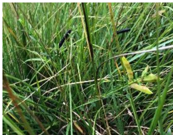
Dyer's greenweed seed pods ripening, AONB 2019