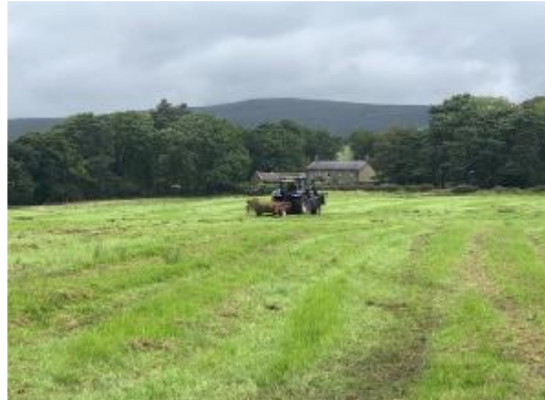
Cutting and collecting green hay at Bell Sykes, followed by spreading at Wellbrook, August 2019.

In total over the project, 9ha of meadows had green hay restoration and 4ha of meadows were enhanced using seed application. The table here provides a summary of the schemes undertaken in 2019.