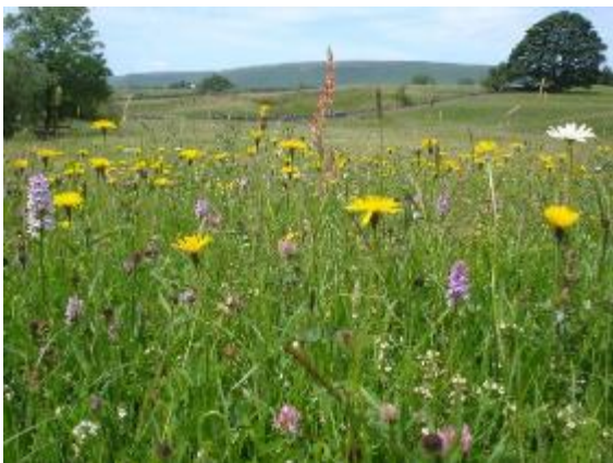
A species rich hay meadow, Forest of Bowland, 2012

YDMT and Forest of Bowland AONB have reintroduced wildflowers to over 700 hectares of degraded meadows across the region since 2006, making important strides in helping to safeguard meadows and the hundreds of species of native wildlife that they are home to. Unfortunately, wildflower meadows are still one of the most threatened habitats in Britain, with 97% of traditional species-rich meadows having been lost since the 1940's. With much more still to be done, the project is building on the success of Bowland Hay Time between 2012 and 2015, and following on from Networks for Nectar, and Wildflowers for the Meadows