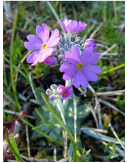
Bird's-eye primrose, L.Kriko, 2005