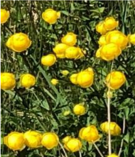
Globe flower near Gisburn Forest, 2018

Delivered by Yorkshire Dales Millennium Trust in partnership with Forest of Bowland AONB, this 14-month project engaged local volunteers and Kew Millennium Seed Bank to propagate and "foster" sustainably collected seed into plug plants.