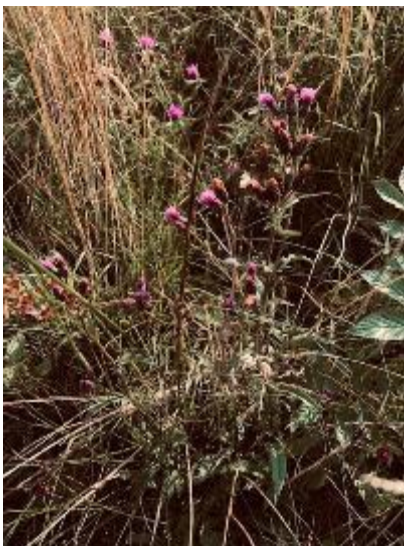
Saw-wort at Hole House, 2018, C. Edmondson.

Kew Millennium Seed Bank at Wakehurst Place in Sussex was commissioned to produce approximately 1000 plug plants from locally sourced seed of the four key species for the project.