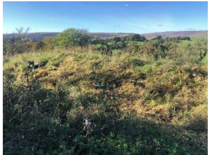
Plug plants in situ at Bell Sykes Farm, Slaidburn, October 2019, C.E.

In addition, 23 melancholy thistle plants and 69 saw-wort were planted in the corner of a higher meadow to the north, which has had previous restoration work done by green hay transfer. The site was chosen for its soil type and pH, and the fact that it is an area not cut when the hay crop is taken, as this removes the flower heads before the seed is set in late flowering species. The meadow is extensively grazed by sheep over winter.