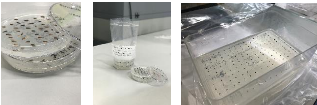
Hay Time Rescue seed set in agar for germination, 2018, Kew Millennium Seed Bank.

The seed was first tested for viability before being sown out in agar trays, and kept in incubators at the appropriate temperature for each species' germination. The globe flower and saw-wort seed were also scarified (i.e. abrasion of the surface) to encourage germination before sowing.