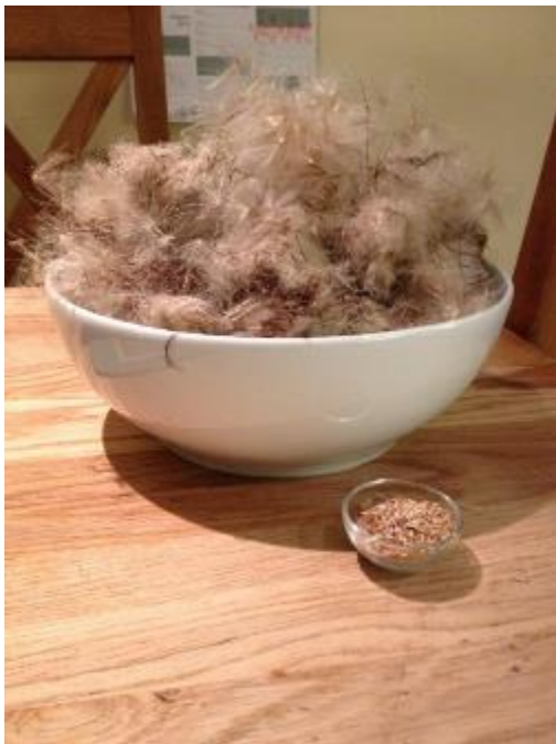
Melancholy thistle down and seed, AONB 2016

The project performance indicators can be found at Appendix 4.