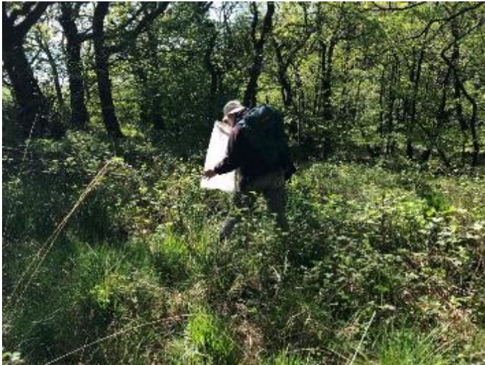
Sampling for Chiastocheta in Gisburn Forest, June 2019.

At one site he recorded three Chiastocheta inermella . According to NBN Atlas there have only been 5 records ever for this species. The Anthomyiidae Recording Scheme, which holds many more records than are on NBN Atlas, also only has these same 5 records, and all are from at least 60 years ago: