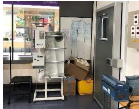
The drying room and sorting rooms at the Millennium Seed Bank 2019, C.E.