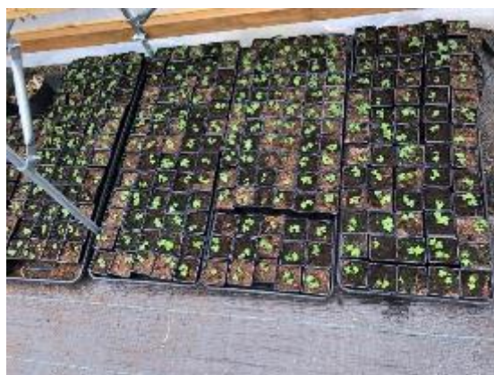
Globe flower seedlings, April and May 2019, M. Breaks.

In total 1066 plugs of the three key species were planted in eight sites around the Forest of Bowland AONB. The table below (in addition to the map at Appendix 1) shows the distribution of the species, where the seed was sourced, and the grower.