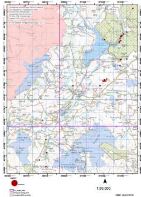
Example map of historic record locations for globe flower in the Forest of Bowland, as supplied by LERN.