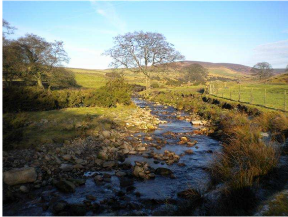
Figure 2 The depleted river downstream of the United Utilities Calder Intake