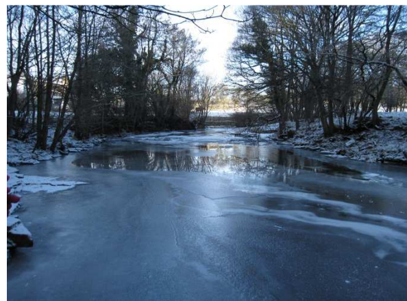
Figure 2 Looking downstream – the pipeline would run through the field on the left hand side