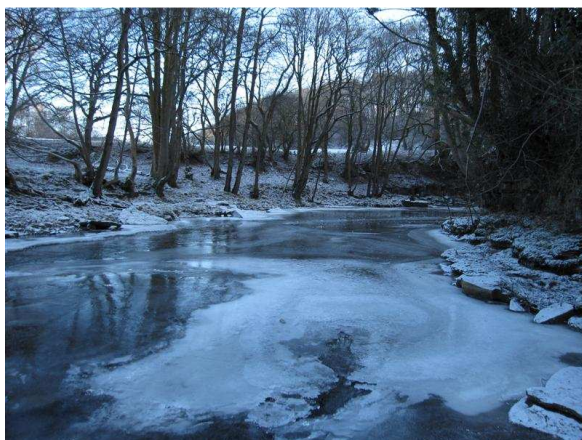
Figure 21 The potential intake location

There is some mill history at this location, but the mill is thought to have fallen into ruin. There is unfortunately no weir remaining in the river. Any potential scheme here would involve the construction of a new weir and either the installation of a turbine directly on this weir, or the digging of a mill race through the field and the installation of a turbine at the end of this mill race. Due to the lack on an existing weir and the limited amount of fall on this meander, it is not likely that this scheme is viable.