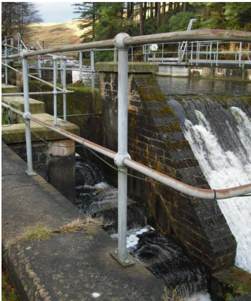
Figure 4 The salmon ladder