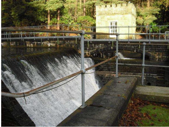
Figure 2 The weir