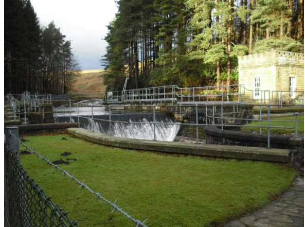
Figure 3 The weir