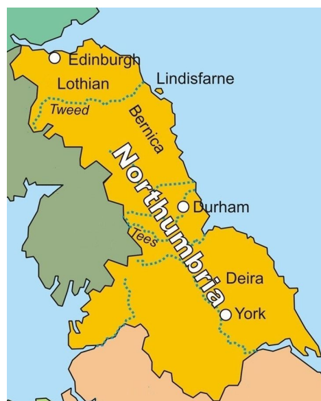
Northumbria in the early ninth century

The fall of York in 866 to the Great Heathen Army - a coalition of Norse warriors, originating from Sweden, Norway, and Denmark, who came together under a unified command to invade the four Anglo-Saxon kingdoms of England – spelt the end of the Angles' rule of Northumbria which had dated back to Oswiu in the mid-seventh century.