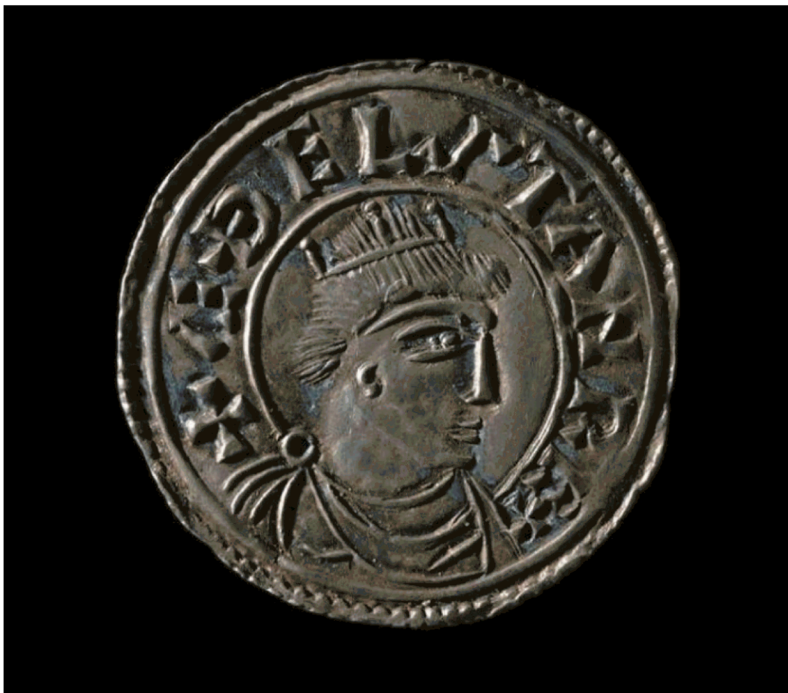
A coin from the reign of King Æthelstan

Tostig's Earldom was the final phase of a West Saxon ascendancy in the North stretching back to the early tenth century. Tostig had been preceded by seven Earls of Northumbria: Siward (1033-55), Erik Haakonson (1016-33), Uhtred the Bold (1006-16), Ælfhelm (994-1006), Thored (975-94), Oslac (966-75), Osulf (955-63). The tenth century was an exceptionally turbulent one characterised by Viking incursion, struggles for supremacy and bloodshed.