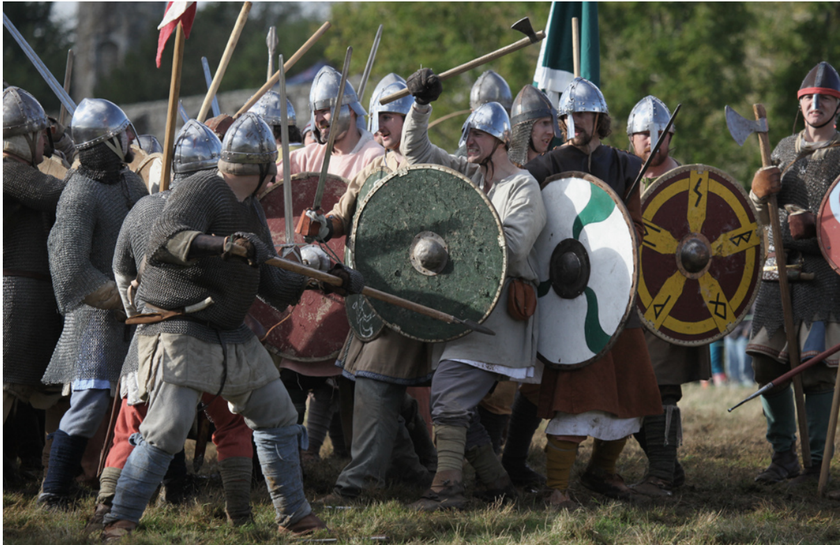
A re-enactment of the Battle of Tetterhall

There is no reference to Amounderness in this text, merely to lands "iuxta Rippel" (next to the Ribble). The historical misattribution may be due to the sixteenth-century antiquarian John Leland who cites Hasmundesham (possibly Amounderness) in his Collectanea , but does so without proper supporting evidence.