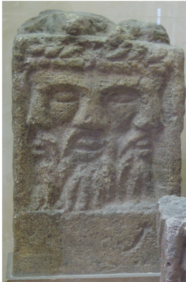
The three-faced Celtic god Lugus

Lug(h) was a variant of the pan-Celtic god Lugus identified by the Romans with Mercury. He was descended from the Fomorians, a supernatural race in Irish mythology.