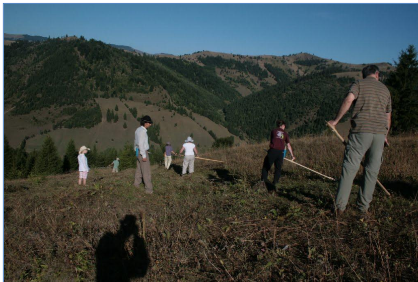
Scything downhill with more meadows in the background edged with spruce saplings