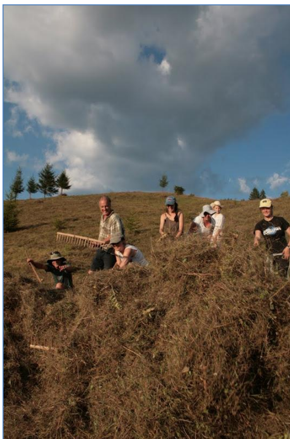
Rolling the hay down hill

In the main, except where the ground is level enough, hay in the mountains is mown by hand. The meadows are not fertilised and one cut is taken between July and August. Haymaking is a collective operation, with scything taking place in a staggered line downhill, with the fastest person always at the front. Once at the bottom of the slope, each person walks back up, spreading out the cut grass as they go. The fastest person jumps down the line if they get held up by the person in front. In this way, our mottled crew of 10, ranging in age from 12 to 50-ish, managed to mow about a hectare in a morning. Amazingly, after lunch, the crop is dry and ready for raking into hay stacks. The raking method was incredibly complicated, and something that we only started to get the hang of by the end of the week. The theory seemed simple enough: two teams of people raking the crop towards each other, working uphill to form a long hay 'sausage' which could be rolled down the hill and then stacked into a neat egg shaped stack. Somehow it never seemed to work quite like that!