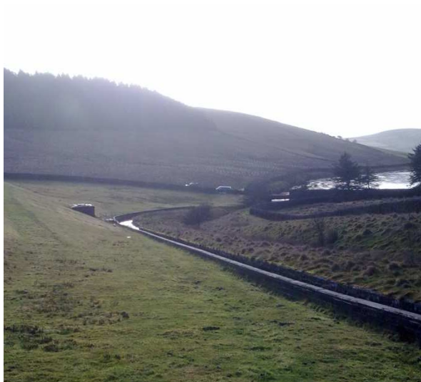
Figure 2 The outflow from the upper to the lower reservoir