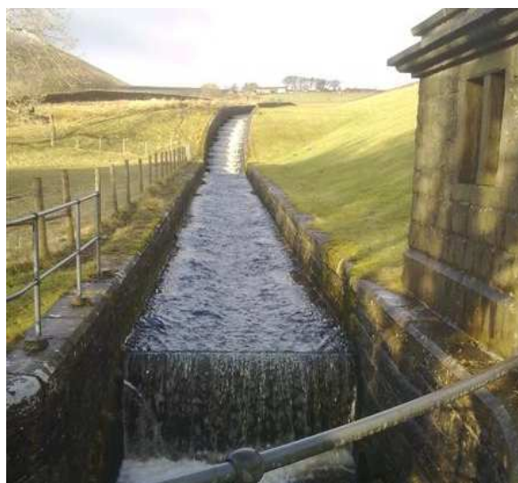
Figure 4 Water flowing from Black Moss lower reservoir