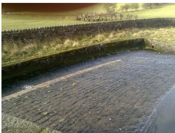
Figure 3 The weir on Black Moss lower reservoir