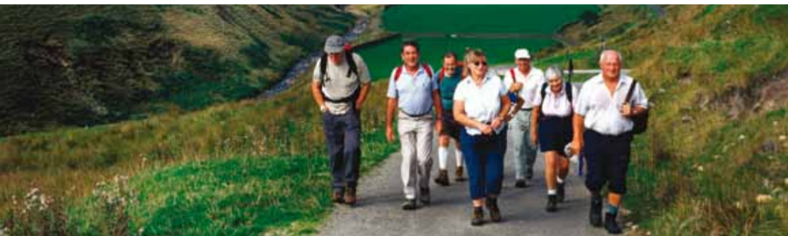
Walkers in the Trough of Bowland ▲

The Forest of Bowland was designated as an Area of Outstanding Natural Beauty in 1964 and covers 803 kilometres (300 sq miles) of rural Lancashire and North Yorkshire.